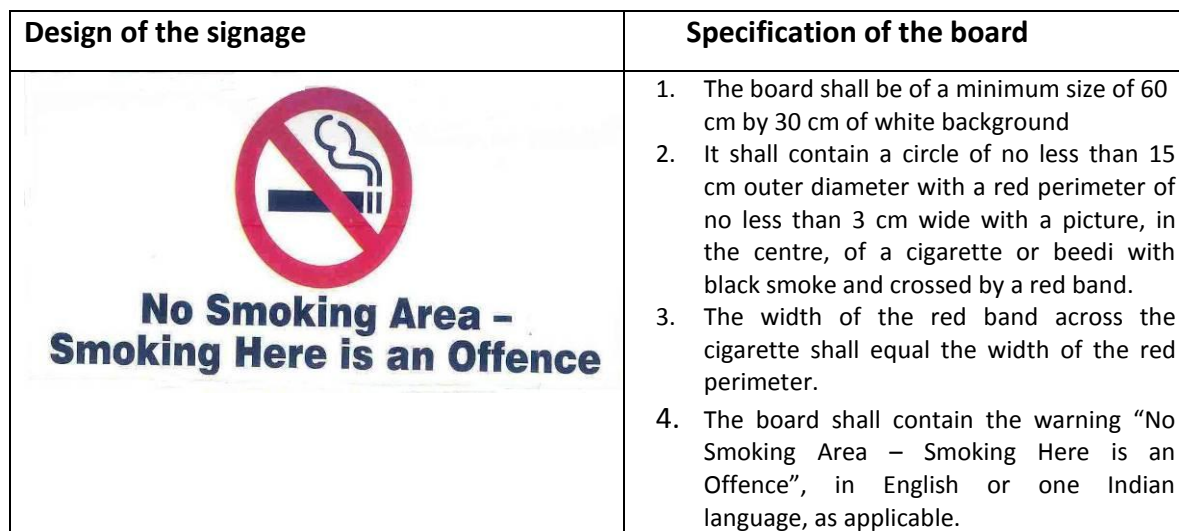
Figure – 1-Signage